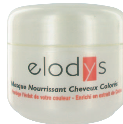
Colored hair mask enriched with cotton extract

For a care deeply cocktail, Choose this hair colored mask. It nourishes in depth the hair shaft, the enzymatic system preserves the beauty and the brilliance of the color.