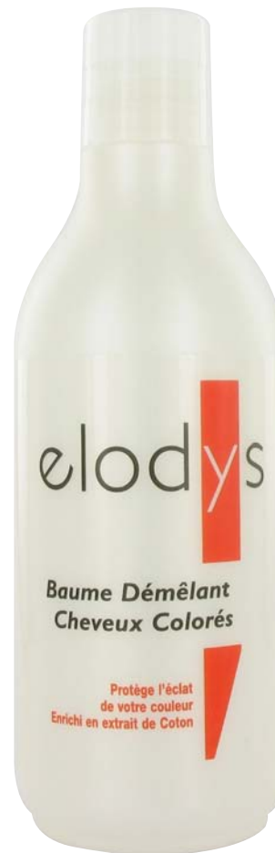
Colored hair balsam enriched with cotton extract

Formulated on a smoothing base, the conditioner without posing time is especially designed for colored or streaked hair.