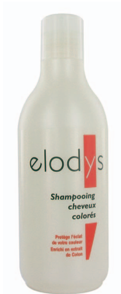
Colored hair Shampoo enriched with cotton extract

Thanks to its creamy foam the shampoo washes the hair gently. The enzymatic system protects durably the brilliance of the hair coloration.